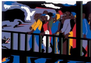
"Confrontation at the Bridge," 1975 Jacob Lawrence (1917-2000)

1965 Selma, AL "Bloody Sunday." March 7, 1965. Crossing Pettus Bridge