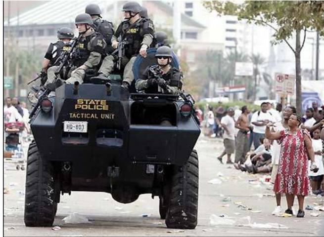
Internal statelessness does not mean "small government"